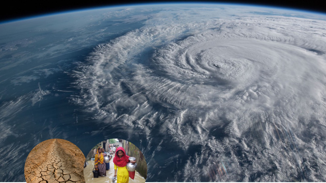
Drought, flood and a satellite image of a hurricane.